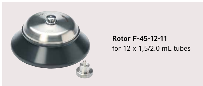
Rotor F-45-12-11 for 12 x 1,5/2.0 mL tubes