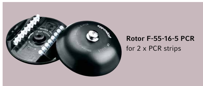
Rotor F-55-16-5 PCR for 2 x PCR strips